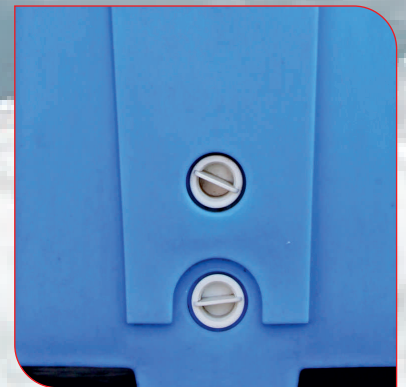
Drainage with parking Facility