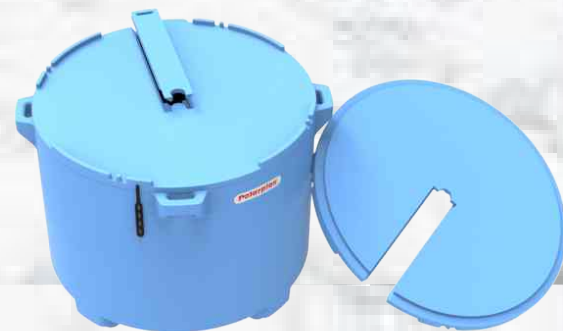
Tub with Lid View