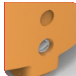
Convenient Drainage with Parking provision